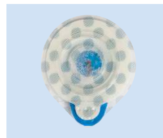
Printed release liner