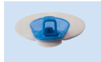
A = 4 mm fitting