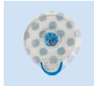
Printed release liner