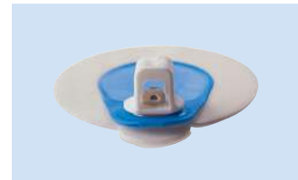
F = 3 mm fitting