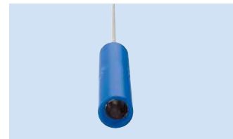
A = 4 mm connector