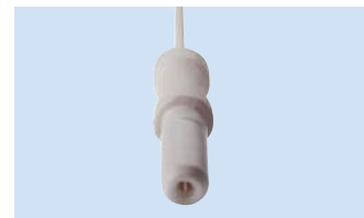
K = 1.5 mm connector