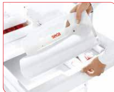
The measuring mat can be rolled up for space-saving storage.